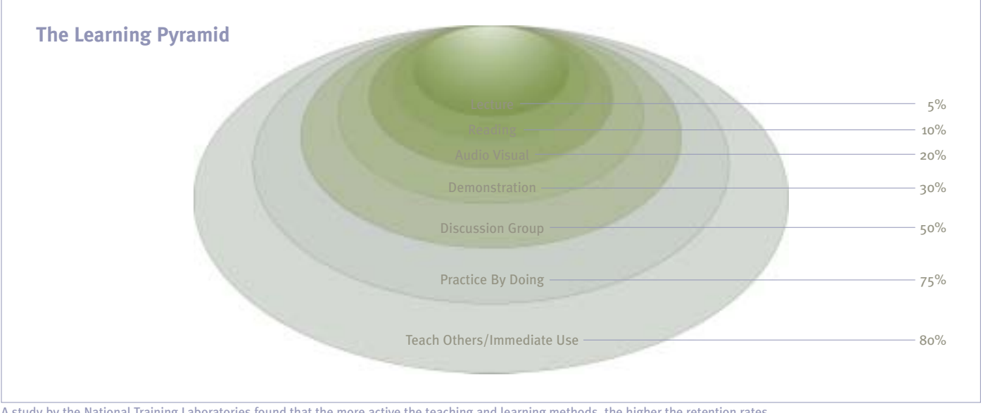
A study by the National Training Laboratories found that the more active the teaching and learning methods, the higher the retention rates. — Adapted from The Learning Triangle: National Training Laboratories © mindServegroup 2005