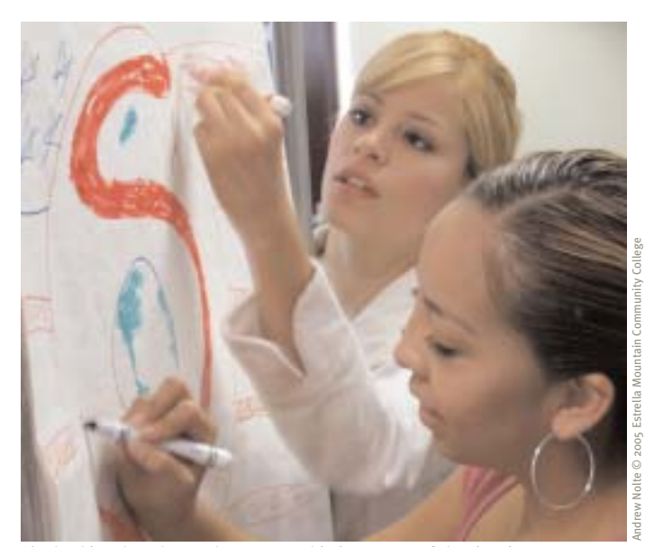
Sharing ideas is an interactive process with the support of visual tools.