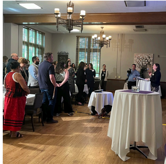
Western Research Scholars Academy Launches