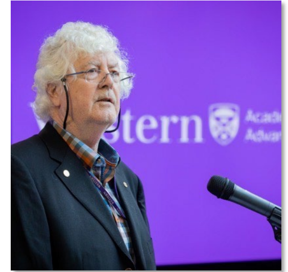
Western Academy for Advanced Research: Third Theme Selected