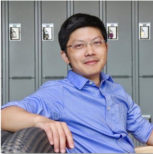
Seven Canada Research Chairs Appointed