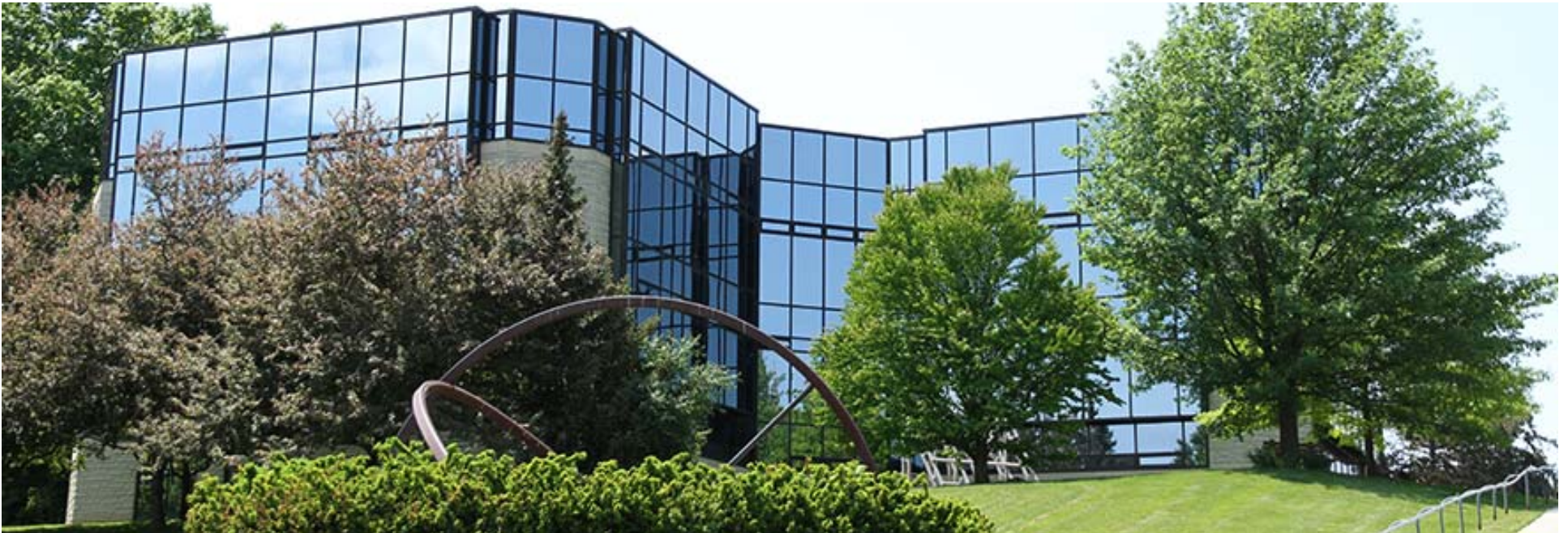
International and Graduate Affairs Building – Level 3, Western University