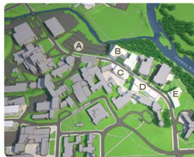
Figure 12: Conceptual Rendering, Perth Drive Site