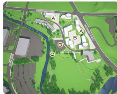
Figure 13: Conceptual Rendering, Westminster Site