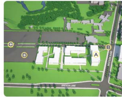
Figure 11: Conceptual Rendering, Springett / Fram Site