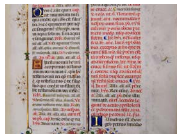
Medieval Manuscript (ca 1441-1448)

Acquired in support of the new Minor in Medieval Studies