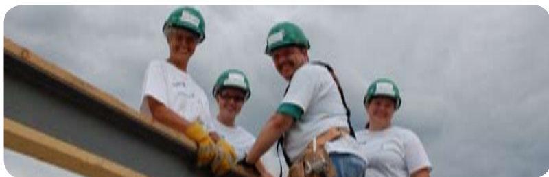
Habitat for Humanity Canada

Performance-Based Compensation: compensation paid to an employee, consultant, or contractor that is linked to performance (e.g., meeting or exceeding established performance goals) but which does not relate in a significant way to funds raised.