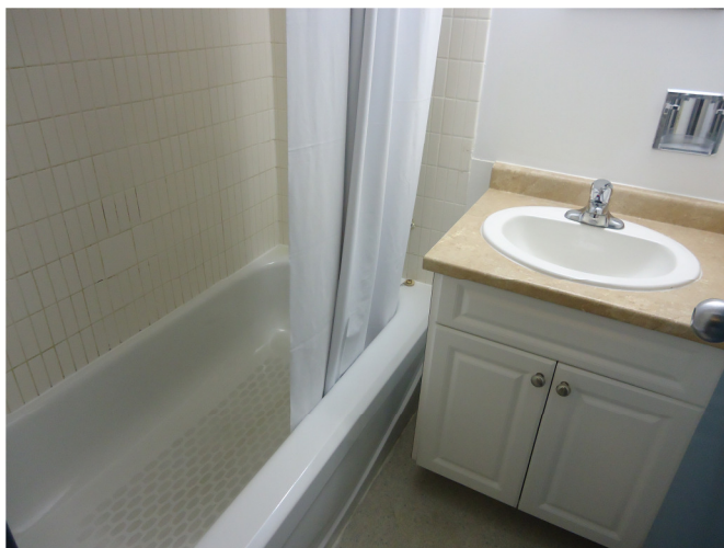
Alumni House – Old tub/tile