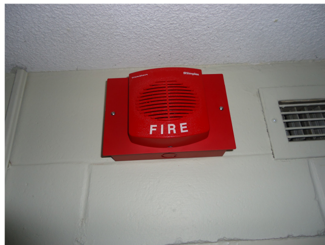
New in-room fire alarm speakers at Saugeen