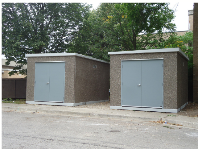
Waste/recycle sheds at Beaver/Ausable