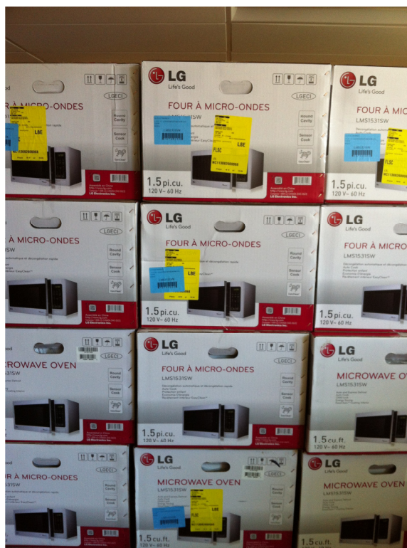
Microwaves for Floor Lounges