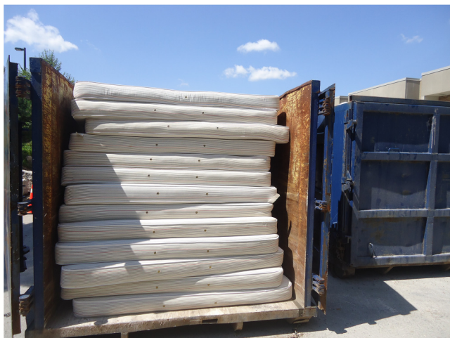
Old mattresses being removed