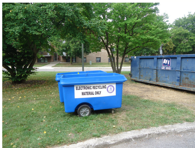
Electronic recycling at apartments