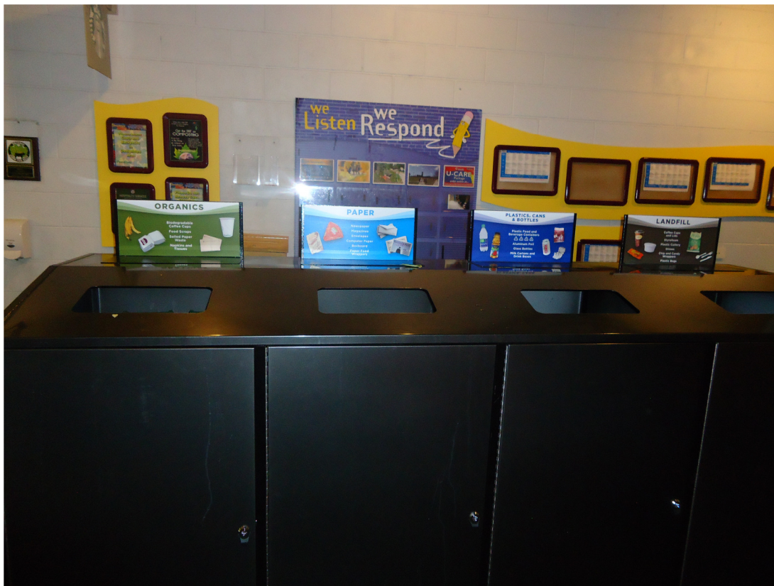
New Compost/Recycle/Waste Bins for Residence Dining Rooms