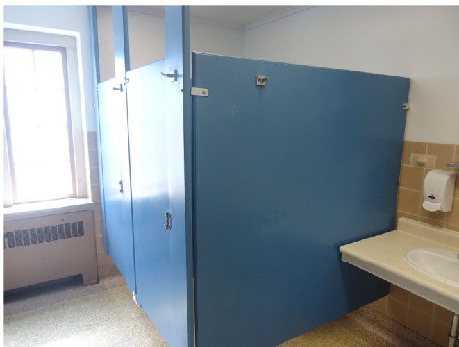
Old washroom partitions