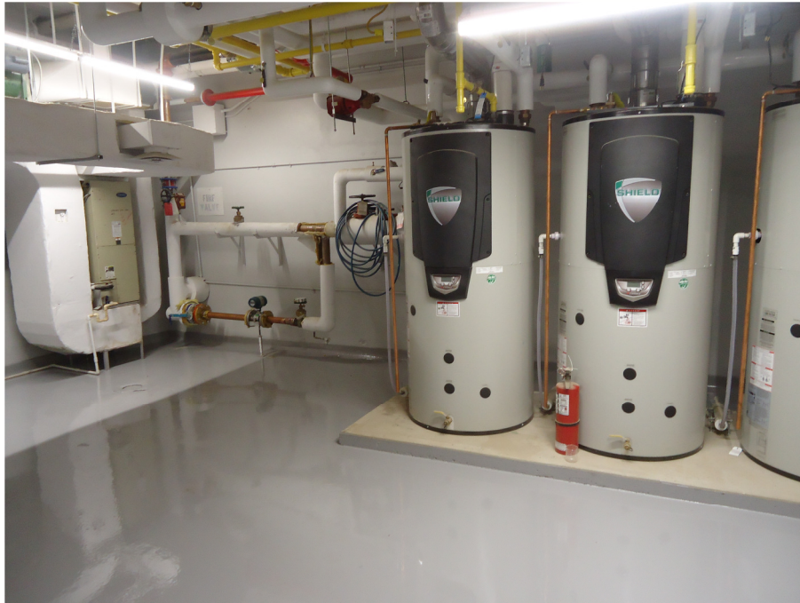
New Domestic Heating Boilers – Sydenham