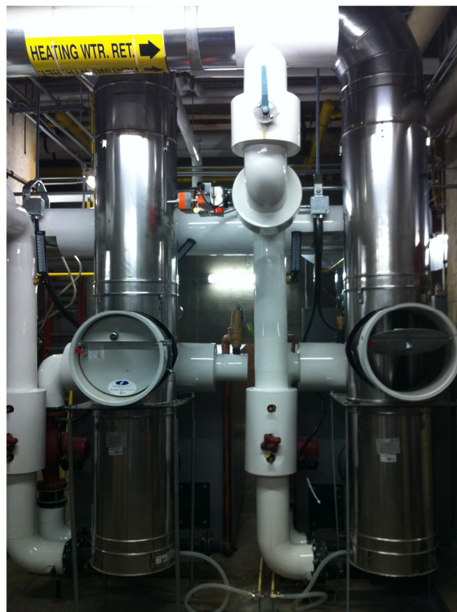
New Domestic Heating Boilers in Saugeen-Maitland Hall