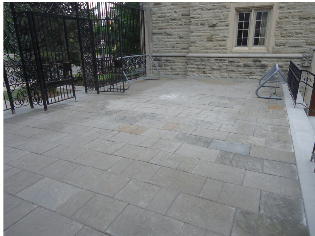
Patio rebuilt and waterproofed at Sydenham