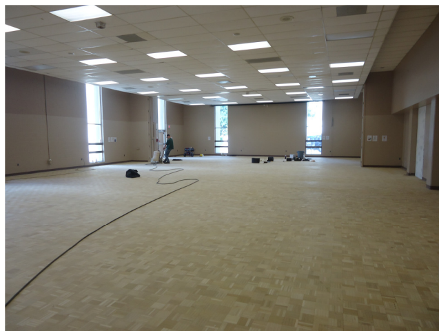
SMHR Main Lounge floor refinishing