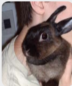
Canadian Federation of Humane Societies

Other resources available online include a Guide to Giving for donors, annual progress reports on the Program, annual supplements in Maclean's and a template to assist with presenting the Ethical Code to boards of directors or senior staff. Ethical Code participants may also be interested in Charity Tax Tools, a website ( charitytax.imaginecanada.ca ) that helps charities understand Canada Revenue Agency requirements. Visit the Ethical Code website ( www.imaginecanada.ca/en/ethicalcode ) for these resources as well as the most up-to-date list of Program participants.