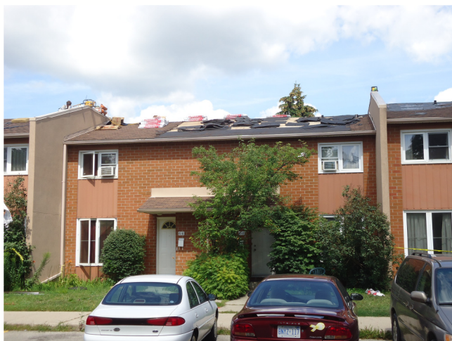
Platt's Lane roof replacement