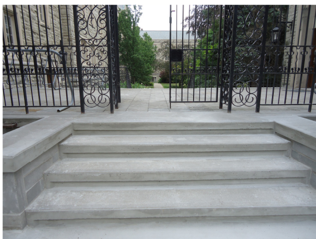
Stairs rebuilt at Sydenham