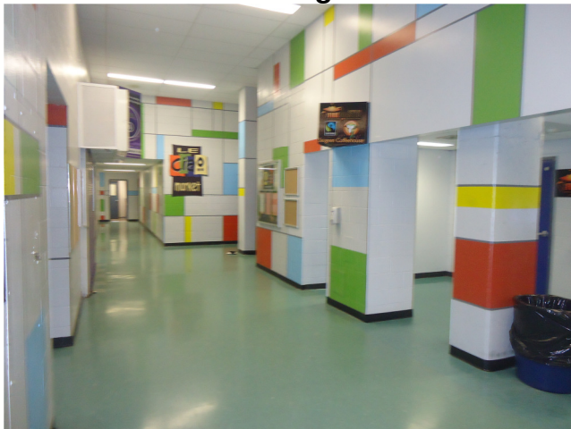
Saugeen- Maitland Entrance/Lobby - Before

Saugeen-Maitland Hall and Sydenham Hall were the focus of four major projects that commenced just hours after the students vacated in May. In Saugeen-Maitland Hall, the main entrance underwent a major renovation to make it more functional, more welcoming and far more aesthetically pleasing. Fire alarm speakers were installed in every student room to enhance resident safety, and old steam boilers were replaced with new energy-efficient hot water boilers to provide domestic heating.