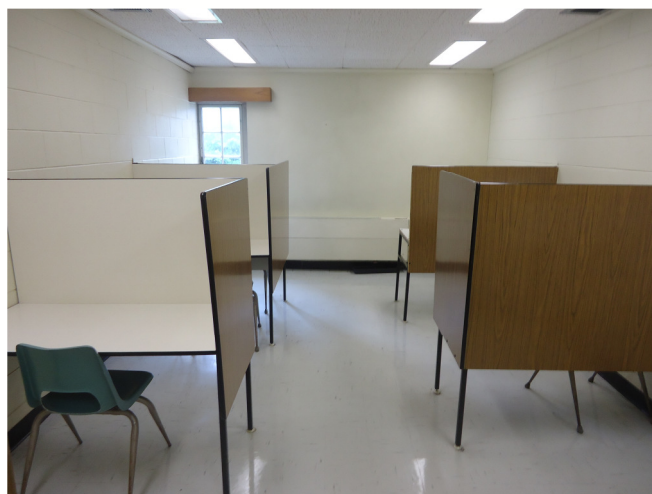
Old Delaware Hall Study Room Furniture