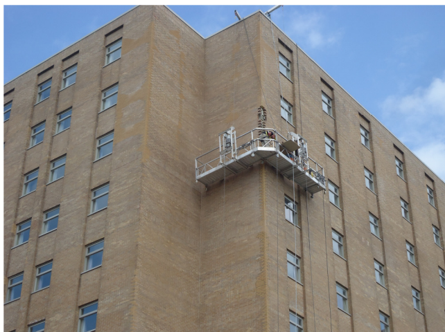
Exterior brick repairs at SMHR