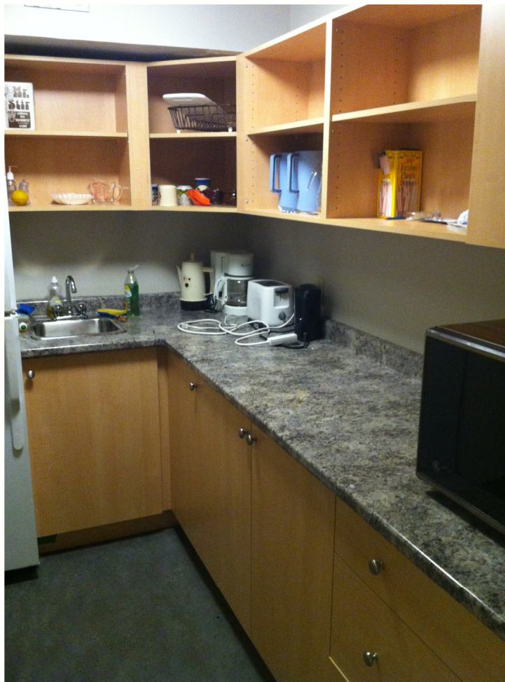
Renovated Platt's Lane Estates Community Centre