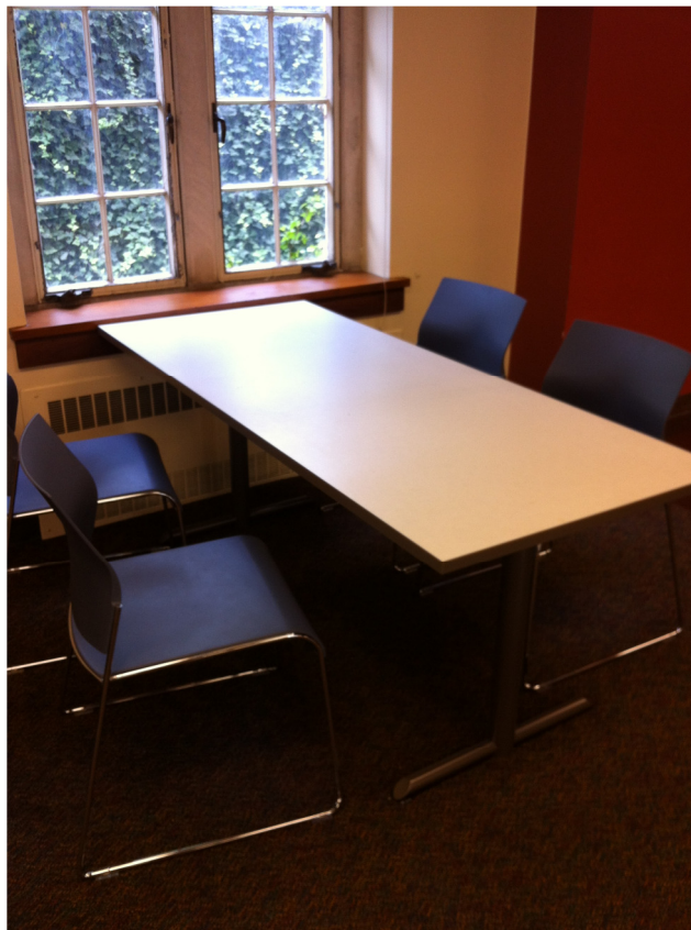
New Delaware Hall Study Furniture