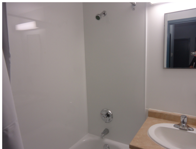
Alumni House – New tub & surround