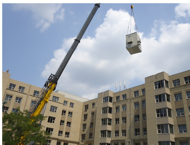
Cell phone transmitter installed on Essex Hall