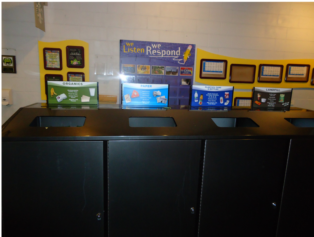
New Compost/Recycle/Waste Bins for Residence Dining Rooms