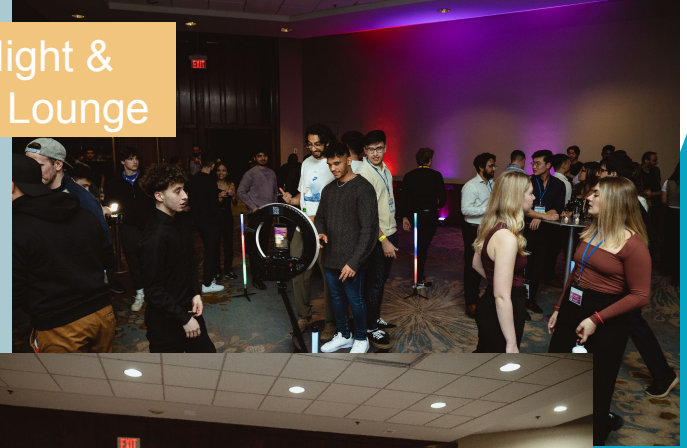
Club Night & Mocktail Lounge