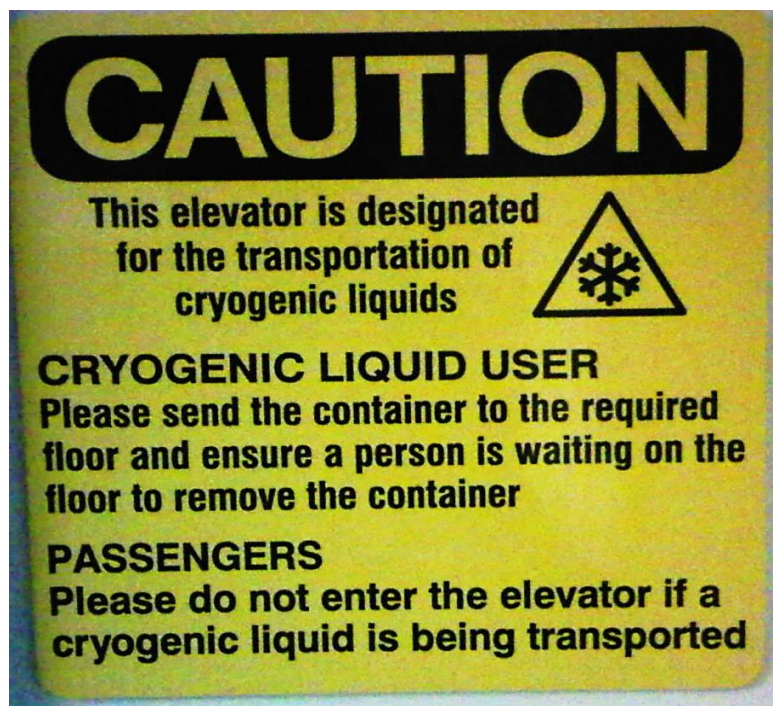
Figure 2. Sign beside the large elevator in the Chemistry Building.

There is a sign beside this elevator to identify it as an approved elevator. See picture below.