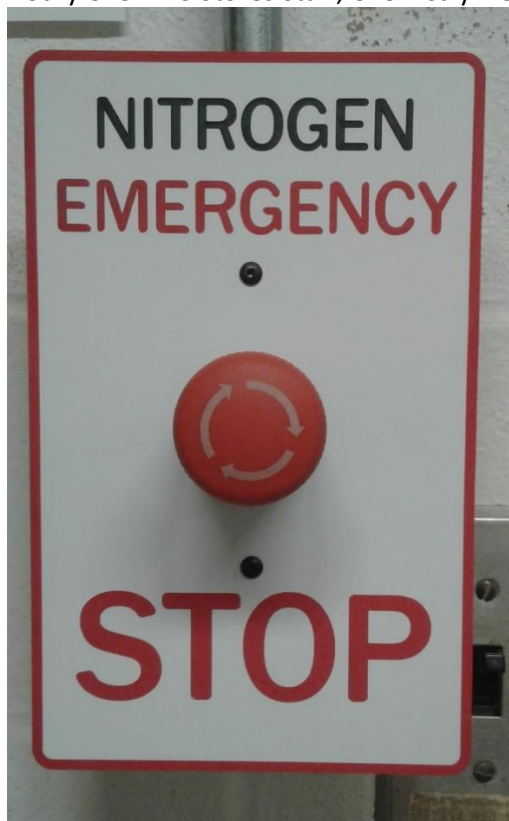
Figure 4. Emergency Stop button located beside main door.

Pressing the Emergency Stop Button located beside the door will stop all dispensing. Notify ChemBio Stores Staff, Chemistry Electronic Shop or Departmental Manager of problem.