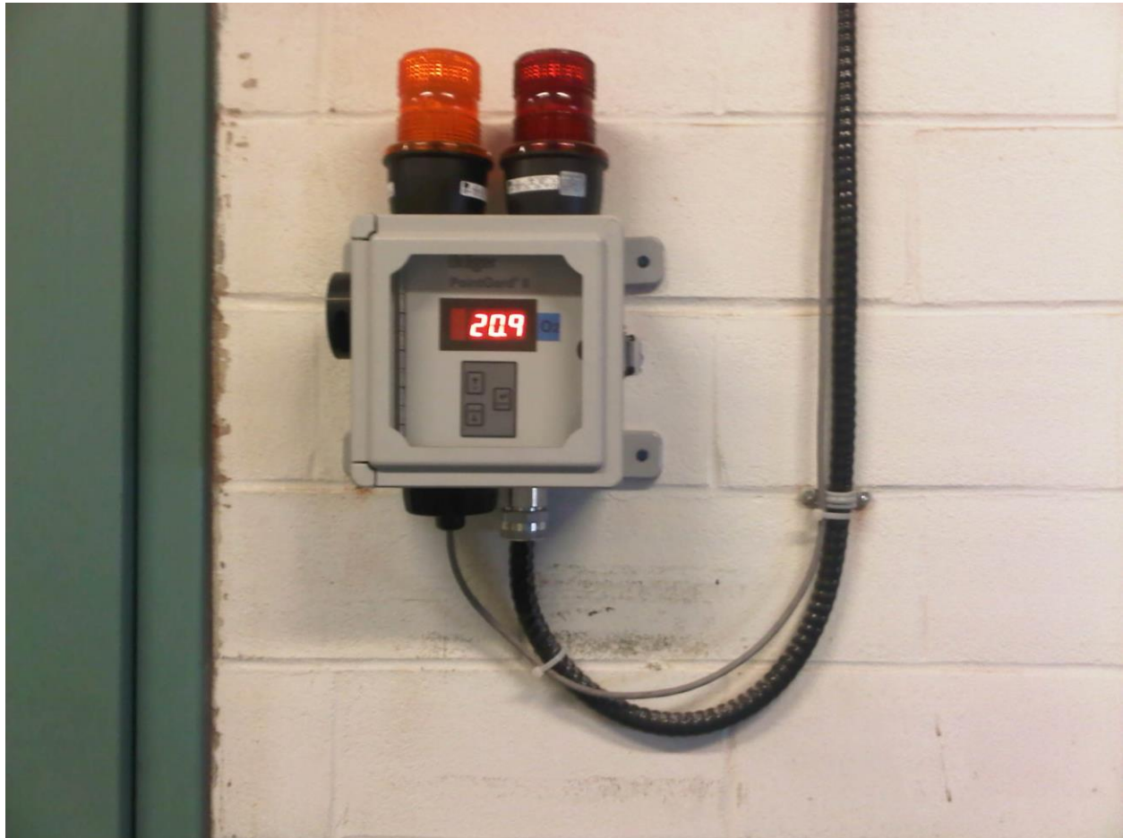
Figure 5. The LNDF's oxygen sensor. The oxygen level value display is located just outside the LNDF.

Report the incident to ChemBio Stores Staff or to the Departmental Manager immediately.