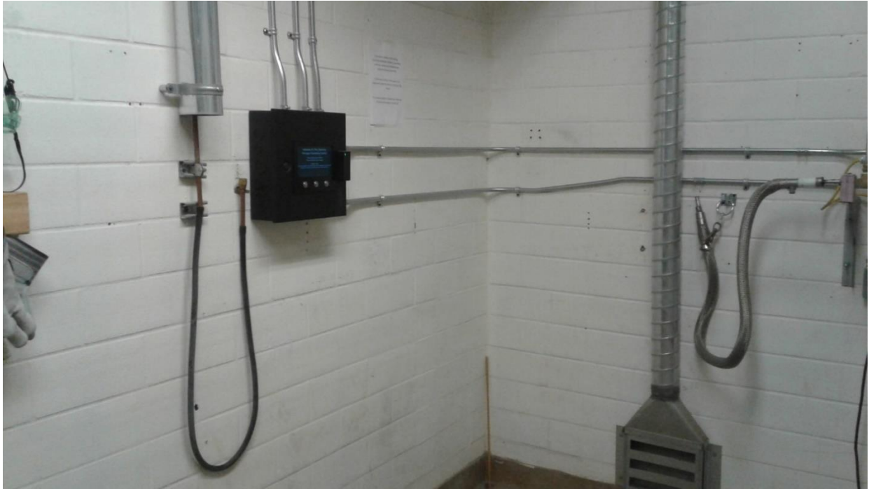
Figure 6. Closed Dewar Filling Station