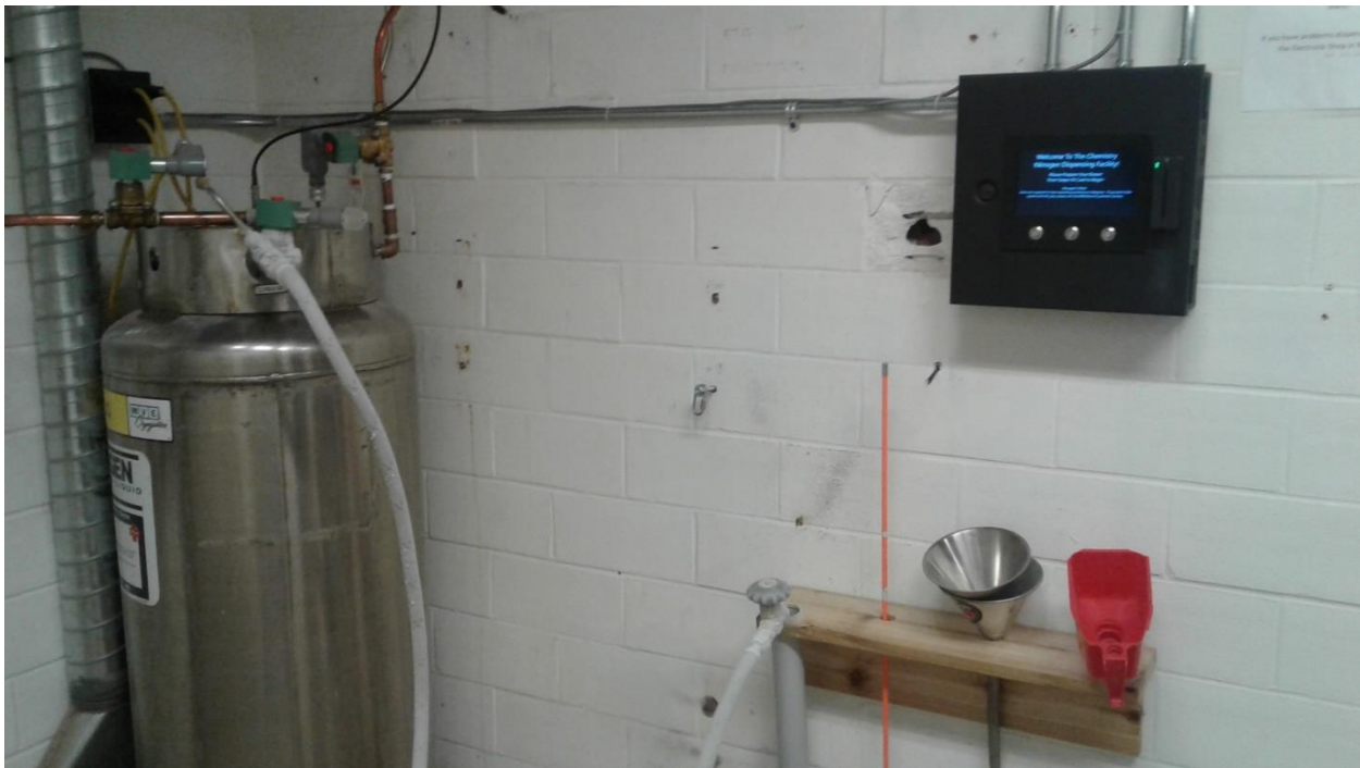
Figure 7 Open Dewar Filling Station