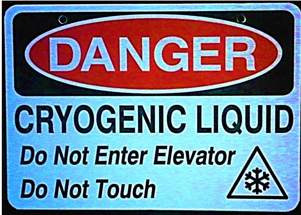
Figure 3a. Elevator Warning Sign