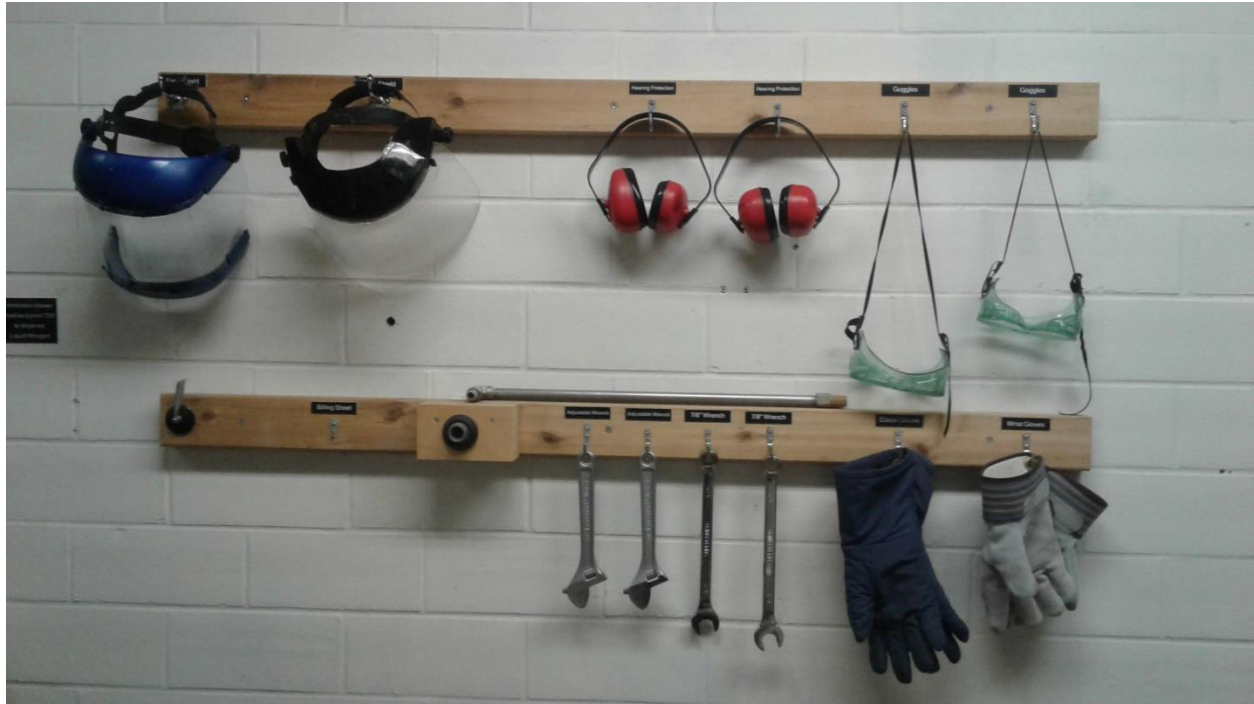
Figure 1. Personal protective equipment available in the LNDF.

Anyone found removing any of these items from the LNDF will have their liquid nitrogen dispensing privileges removed.