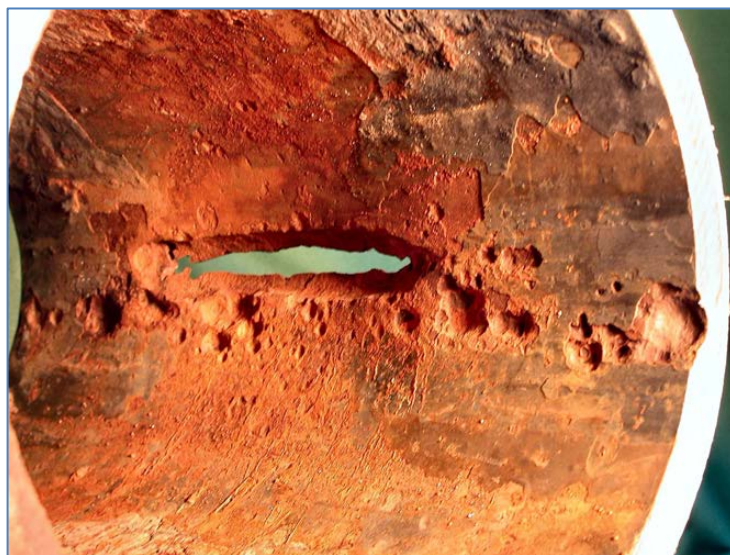
Figure 2 – Cleaned pipeline surface at the rupture location with pitting corrosion present.

A 10-3/4" nominal diameter subsea water injection pipeline 32 km in length transports seawater from the offshore Siri oil production platform to the Nini platform. In Q4 2007 a rupture of the pipeline occurred 2 km from the Siri platform. A close-up of the internal surface of the pipe at the rupture site is shown in Figure 2.