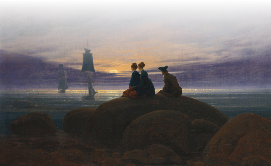
Caspar David Friedrich, 1822