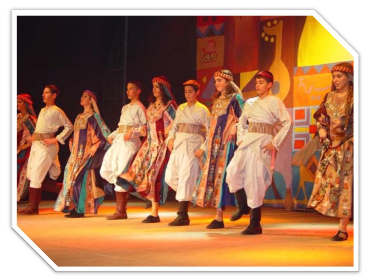
Traditional Arabic dancing called Debke