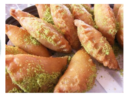
Some famous Middle Eastern Arabic food and sweets