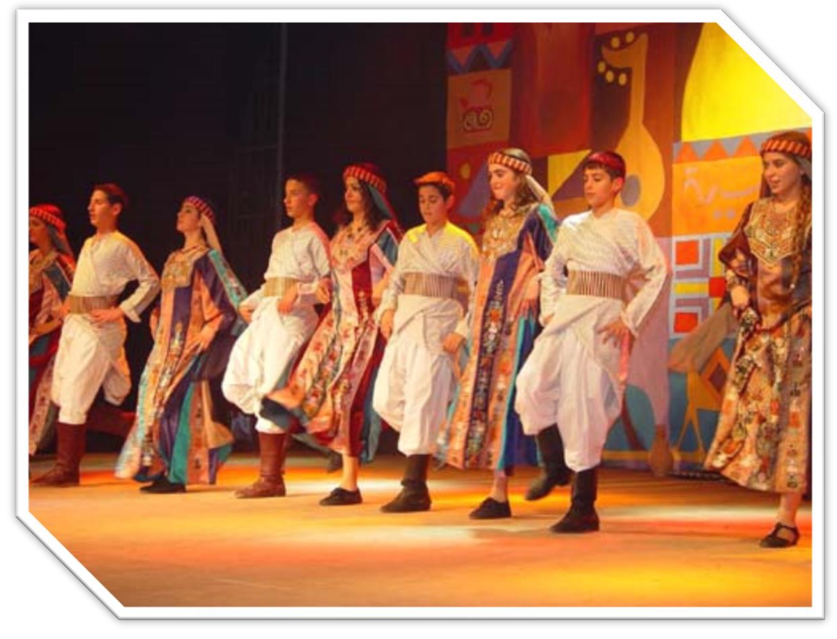
Traditional Arabic dancing called Debke