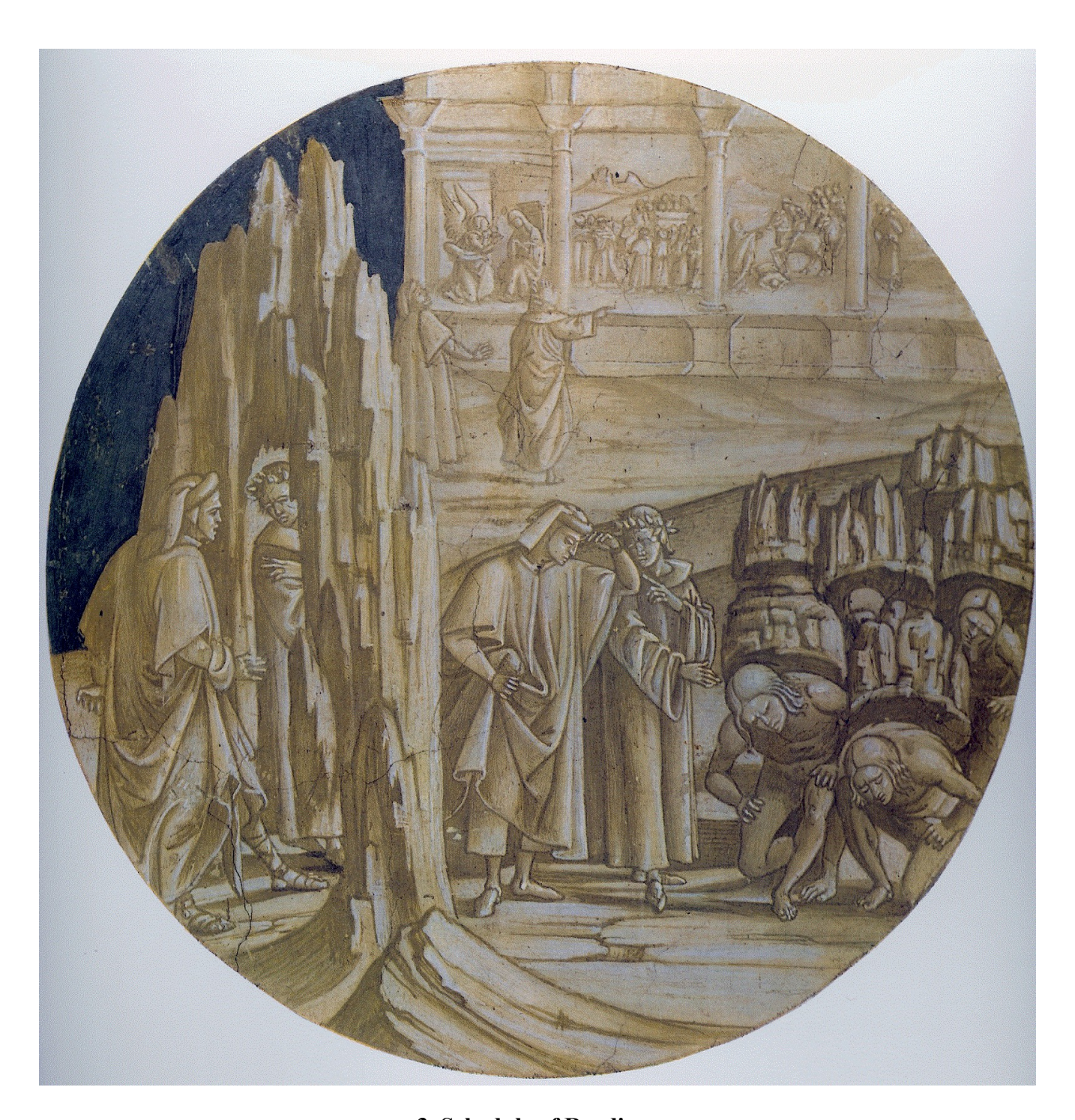
3. Schedule of Readings