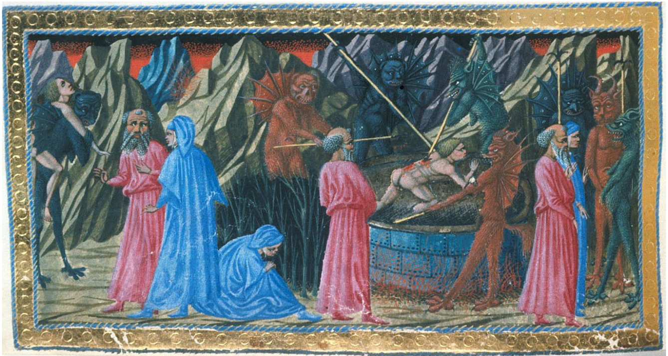
Bolgia of the Barrators: 15 th century