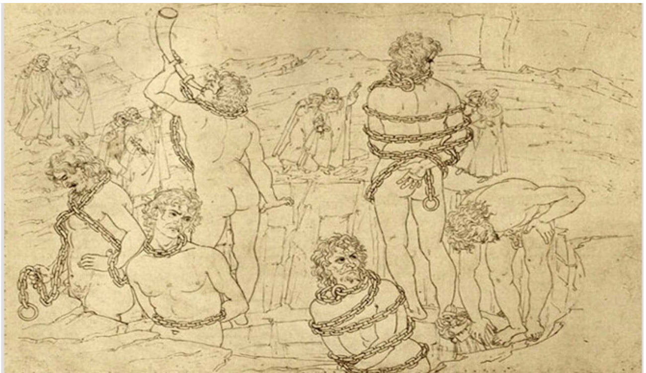
The Giants: 15 th Century