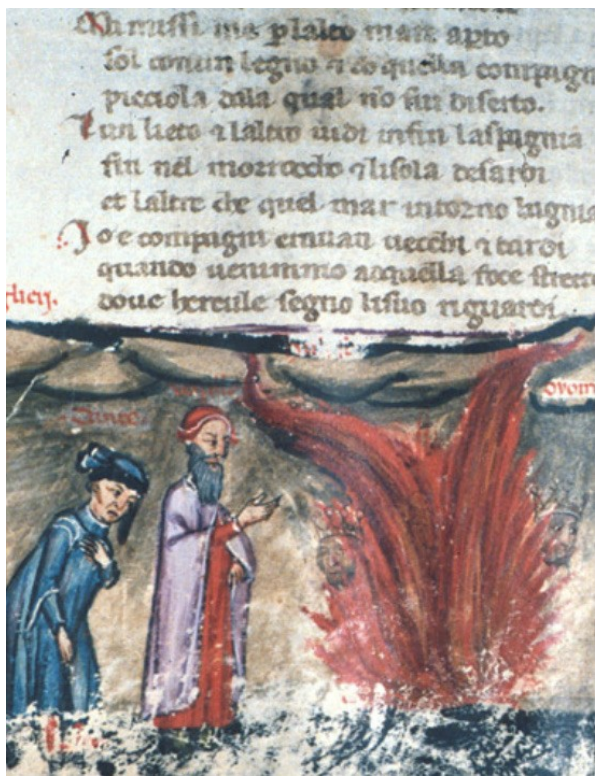
Ulysses 14 th c