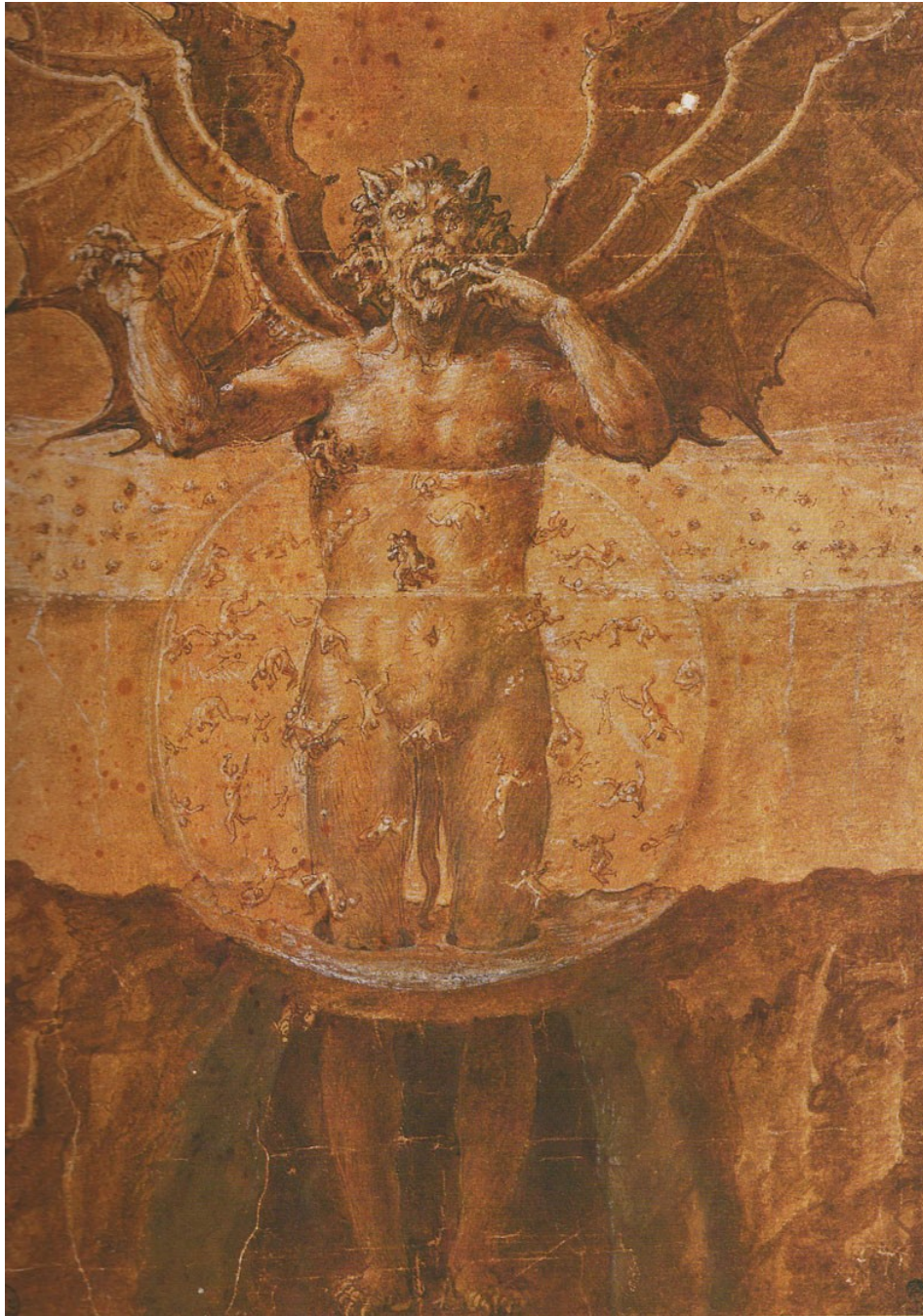
Satan and the Traitors: 16 th century