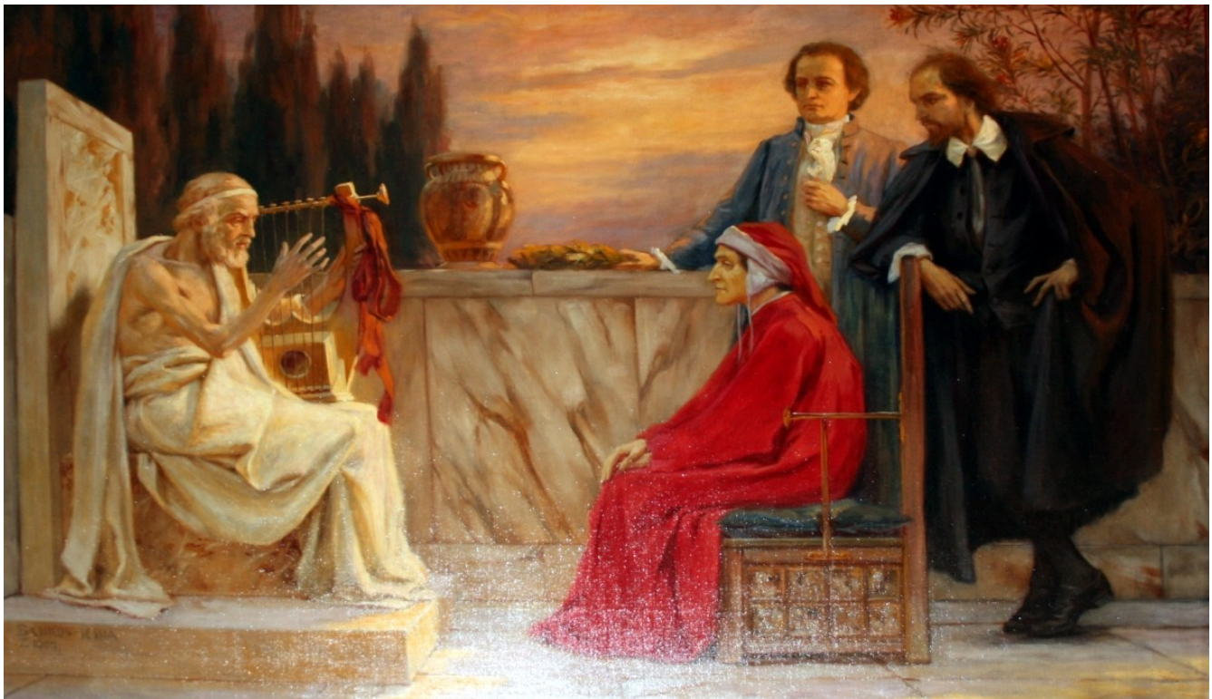
Bela Čikoš Sesija, “Homer Teaches Dante, Shakespeare, and Goethe to Sing” (1909)

Fall/Winter Term 2021 Wednesdays 9:30-12:20pm Room: TBA