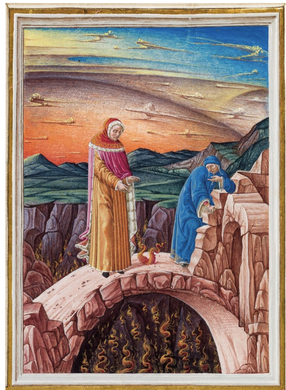
Ulysses 15 th c