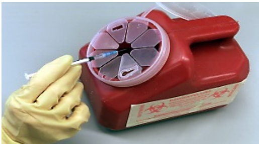
Figure 1: Sharps container used to dispose of needles and other sharps.

You may see this symbol on many things, including labels, waste, sharps containers and signs.