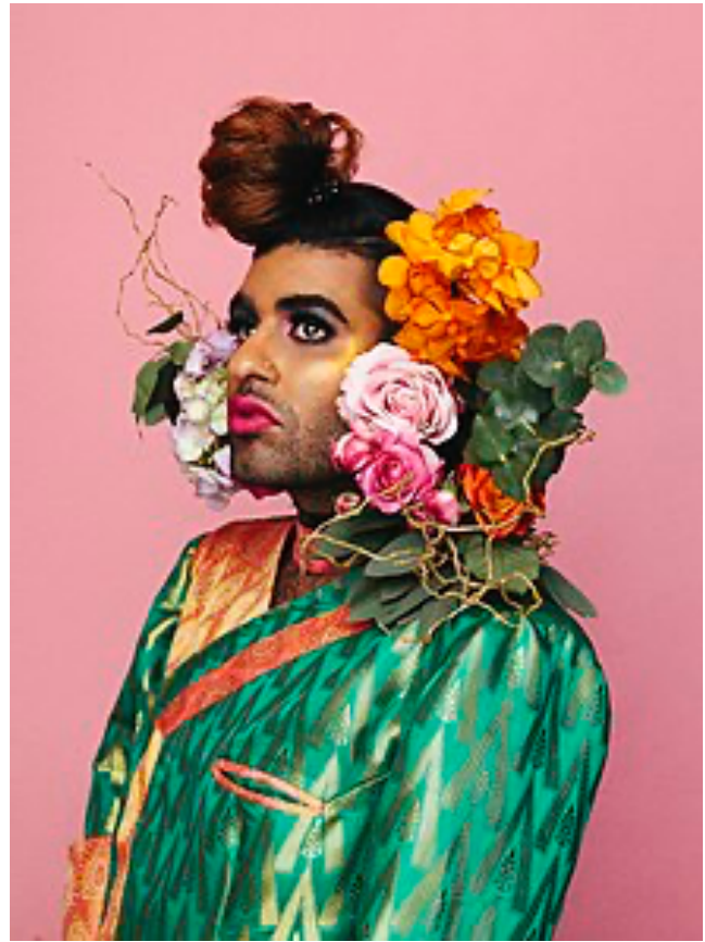
Alok Vaid-Menon. 2018.

Students seeking academic accommodation on medical grounds for any missed tests, exams, participation components and/or assignments worth 10% or more of their final grade must apply to the Academic Counselling office of their home. Faculty and provide documentation. Academic accommodation cannot be granted by the instructor or department. For UWO Policy on Accommodation for Medical Illness see the online Academic Calendar; information can also be found here: https://studentservices.uwo.ca/secure/index.cfm