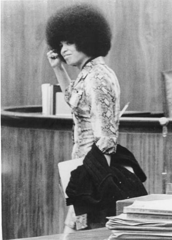
Activist and philosopher Angela Davis entering court room, 1972.

Students are encouraged to use OWL messages to contact the instructor and TAs. Emails/OWL messages to the instructor and TAs will be responded to within 48 hours during regular working hours (Mon – Fri, 9-5pm). Please take note of and respect these working hours. If contacting the instructor or TA(s) via email, students must include the course code (GSWS2164) in the subject