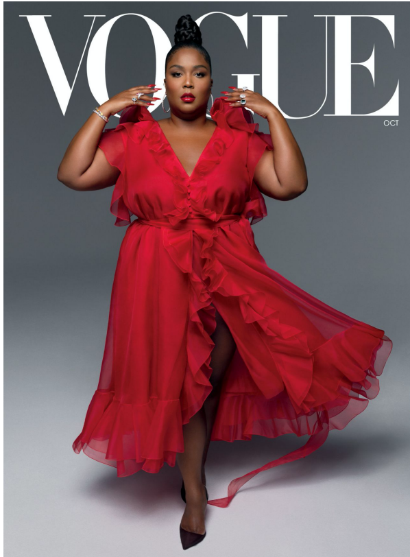
Lizzo on cover of Vogue , October 2020.