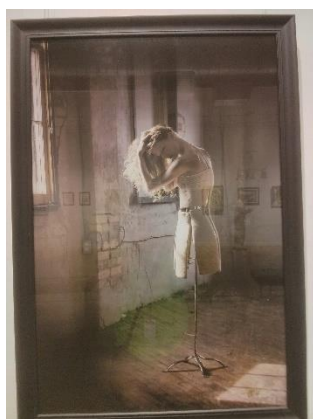
Echoes of Stray Souls by Maaïke Roosendaal

Over 400 attended Opening Day and a total of almost 1,000 enthusiastic visitors viewed the show during the run of the exhibit.