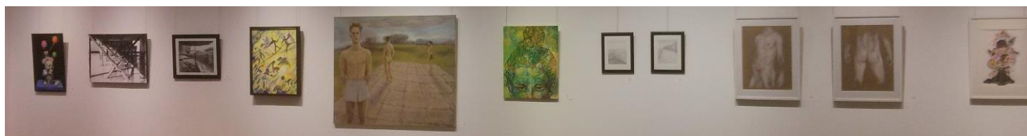
East Wall: The ARTS Project