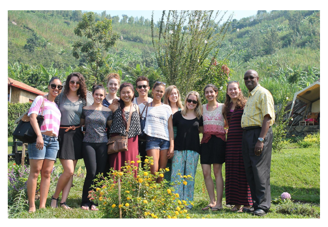
The 2015 UWO Team in Gisenyi