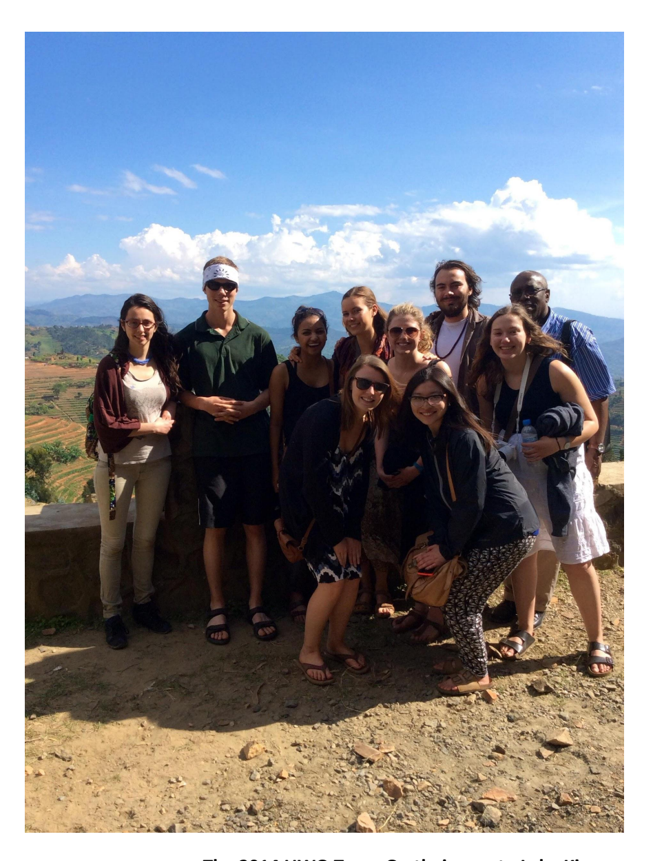
The 2014 UWO Team On their way to Lake Kivu

This experiential learning trip was the most incredible experience. I was able to witness first-hand the vitality and strength of a people who had so recently been overwhelmed with hurt and violence. Within those five short weeks in Rwanda, I encountered more inspirational men and women than I had in my entire life. Being able to work with the Rwandan people for a brighter future has truly allowed my intercultural competence to grow. This experience has eliminated any preconceived notions I had associated with Rwanda because of its past and has therefore allowed me to become a better global citizen. I have been to twenty countries and five continents in my life and have yet to experience a place so filled with beauty, strength, perseverance and kindness as Rwanda. I am counting down the days until I will return.