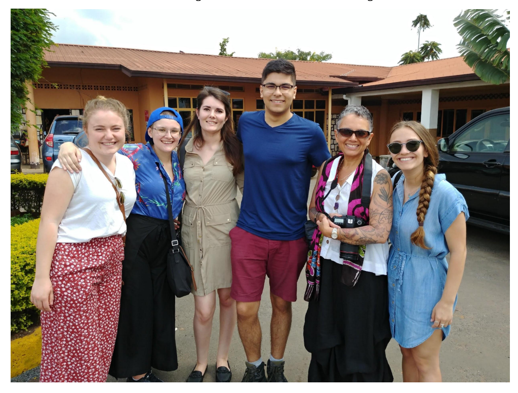
Centre St. At Paul Hostel: Our second home!