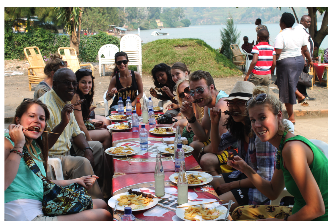
The 2013 UWO Team enjoying local food and the beach in Gisenyi