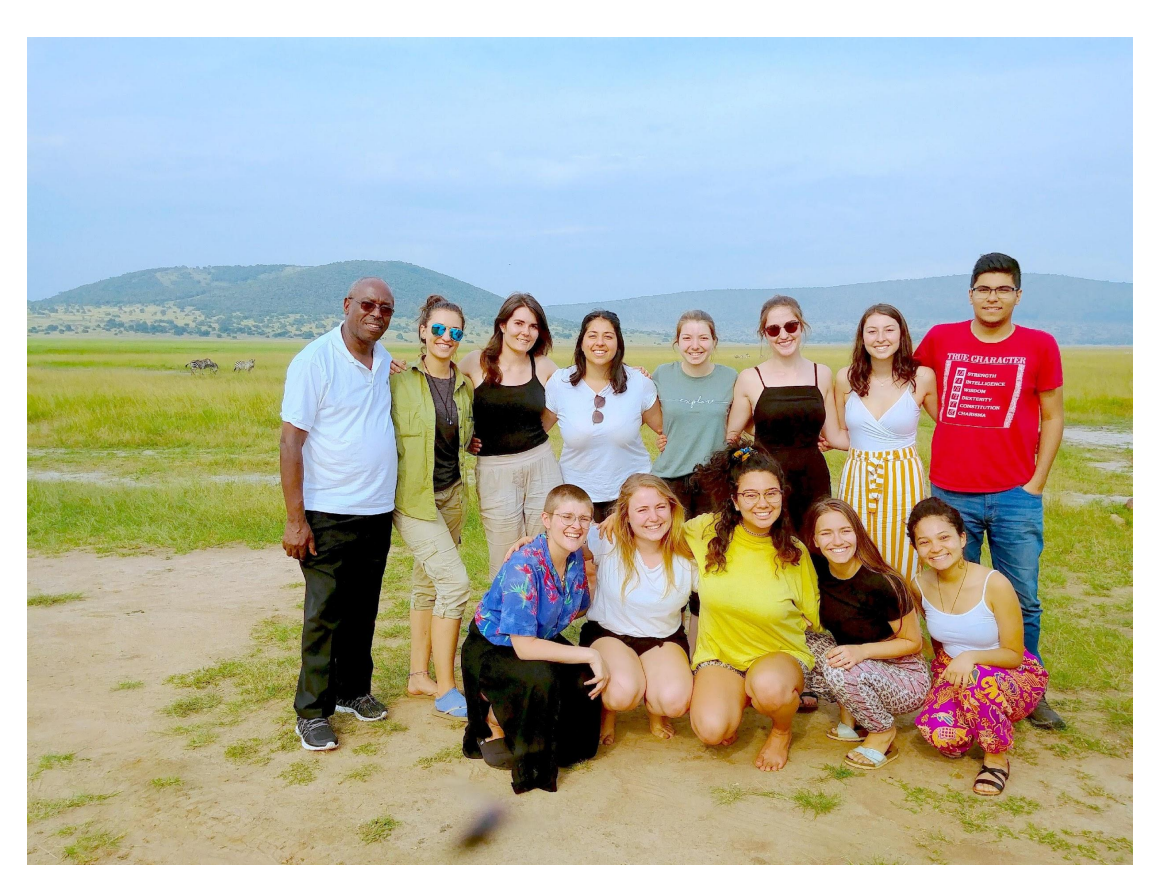
The 2019 Happy Team at Akagera National Park!!