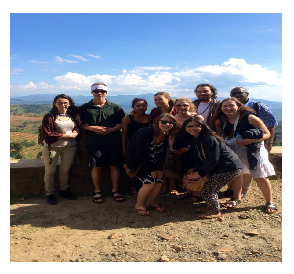
The 2014 UWO Team On their way to Lake Kivu

This experiential learning trip was the most incredible experience. I was able to witness first-hand the vitality and strength of a people who had so recently been overwhelmed with hurt and violence. Within those five short weeks in Rwanda, I encountered more inspirational men and women than I had in my entire life. Being able to work with the Rwandan people for a brighter future has truly allowed my intercultural competence to grow. This experience has eliminated any preconceived notions I had associated with Rwanda because of its past and has therefore allowed me to become a better global citizen. I have been to twenty countries and five continents in my life and have yet to experience a place so filled with beauty, strength, perseverance and kindness as Rwanda. I am counting down the days until I will return.