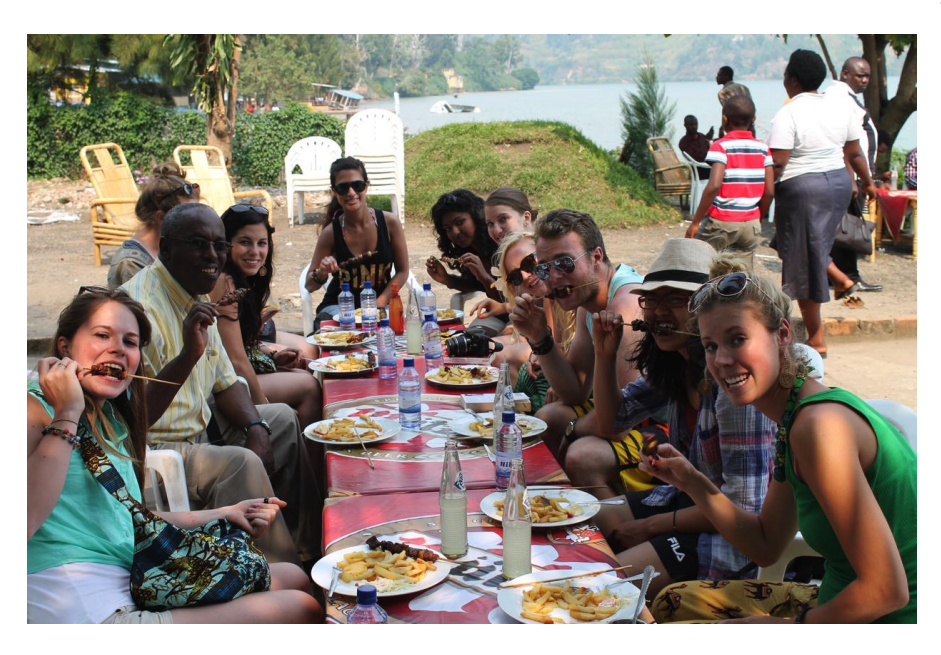
The 2013 UWO Team enjoying local food and the beach in Gisenyi