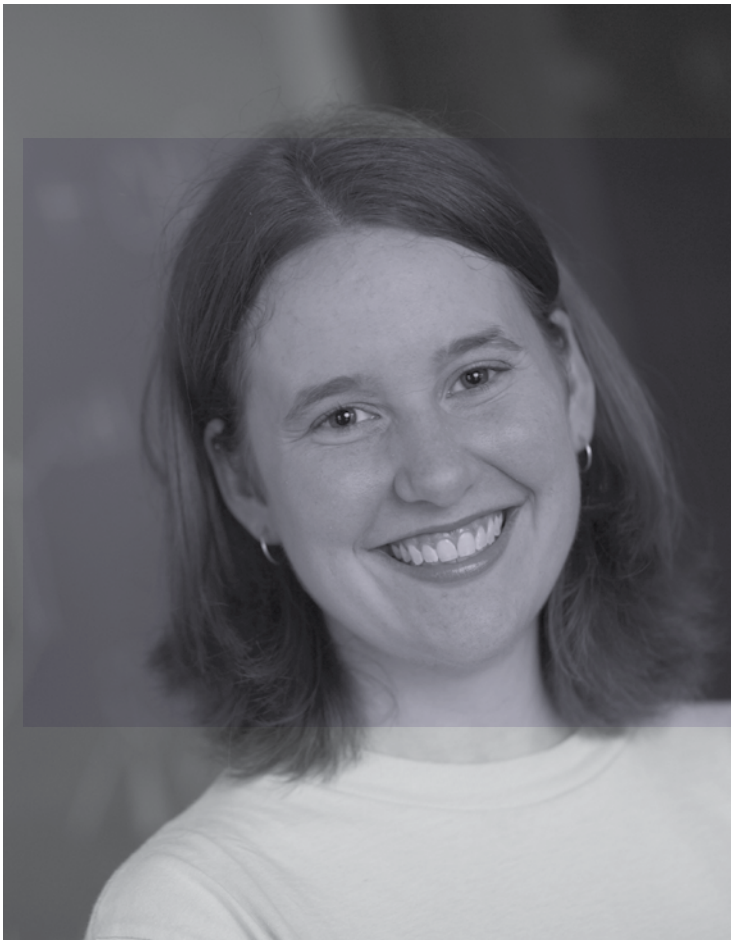
Nearly 12% of Western's total student population is enrolled in the Faculty of Health Sciences.