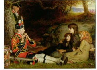
--JOHN EVERETT MILLAIS, "AN IDYLL OF 1745" (1884)