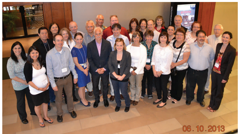
Photograph taken in Toronto at the meeting on June 10, 2013

Thank you to all those attended the June 10 th Steering Committee meeting in Toronto as the 1 st face-to-face meeting to officially launch the FORGE AHEAD program. It was a great turnout with 36 team members from coast to coast, including , Co-Investigators, Community Partners, Collaborators, Policy Makers, and the team at Western all coming together for a day of presentations, discussions, and planning as we move forward in implementing the FORGE AHEAD Program. Working groups met during morning and afternoon breakout sessions to begin development of materials and methods for project #1: Survey of Indigenous Primary Healthcare Capacity and Delivery Models, and the community readiness tool. In addition, progress was made to determine community recruitment plans including inclusion and exclusion criteria, student recruitment, and to advise on data to be collected to facilitate the economic analysis.