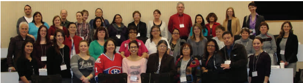
Clinical Teams Workshop, London, January 29-30, 2015

For more pictures go to our Facebook Page: