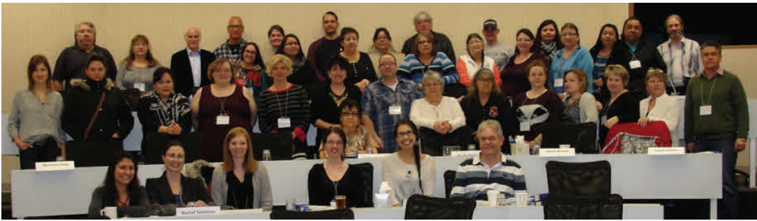
Community Teams Workshop, London, January 27-28, 2015