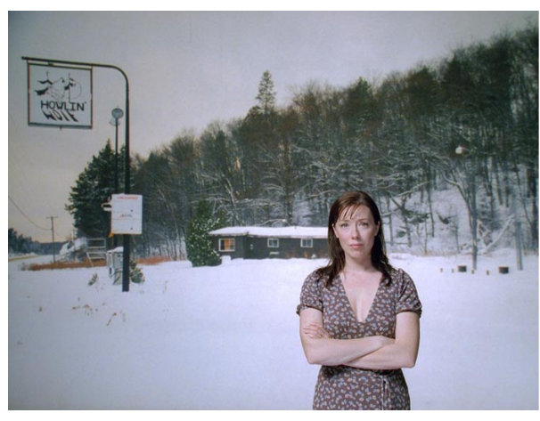
image credit: Rear Projection (Molly Parker), Mark Lewis, 2006. 35mm transferred to 2K, 3'54".

Interviews for next year's Practicum Class will take place March 30 & 31. Sign-up sheets will be available on the counter in the Main Office starting Monday, March 14.