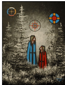
"Resolute" Leland Bell