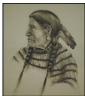
"Grandmother's Teachings" Ferguson Plain