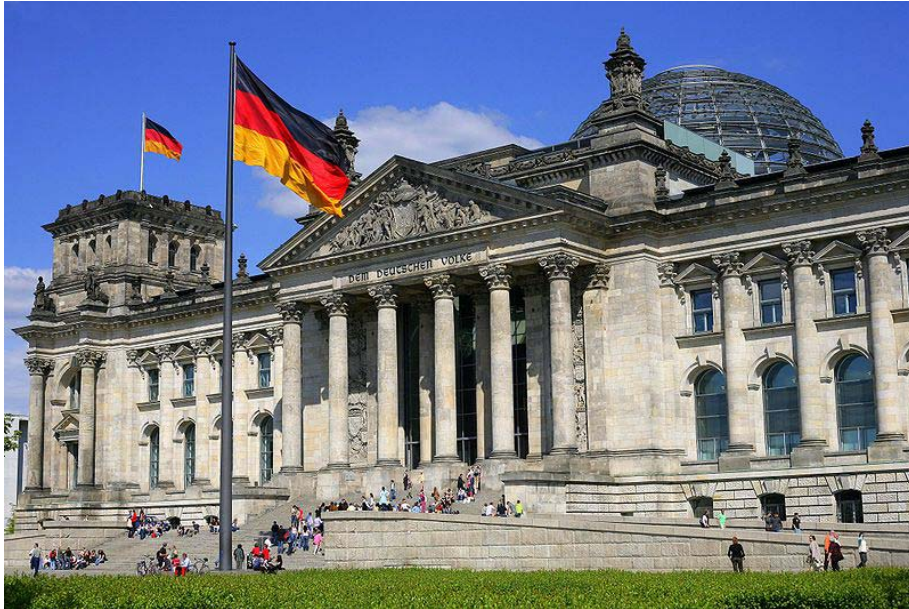
The Reichstag in Berlin is the site of the German parliament.