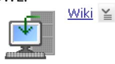
The default icon for a Wiki Space Link

Should you wish to change these permissions, click on the Teach tab, browse to the page where you added the link to your Wiki, and click on the link.